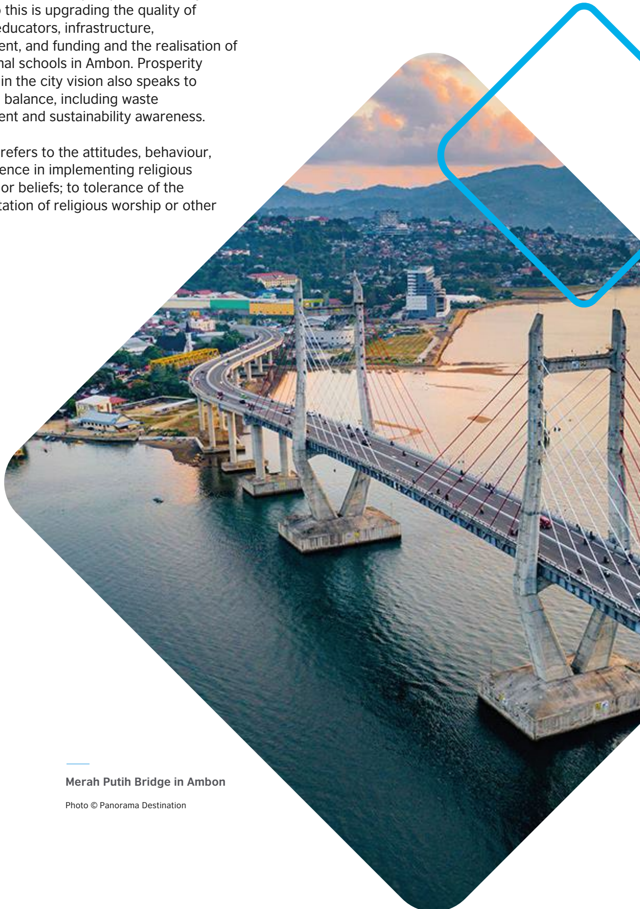
Merah Putih Bridge in Ambon